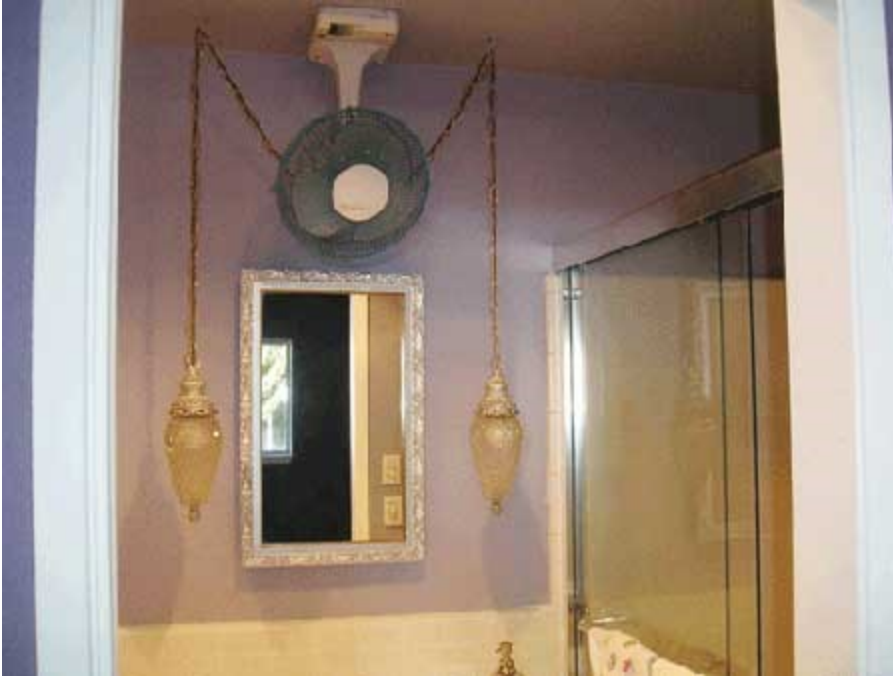
The latest in lighted ventilators