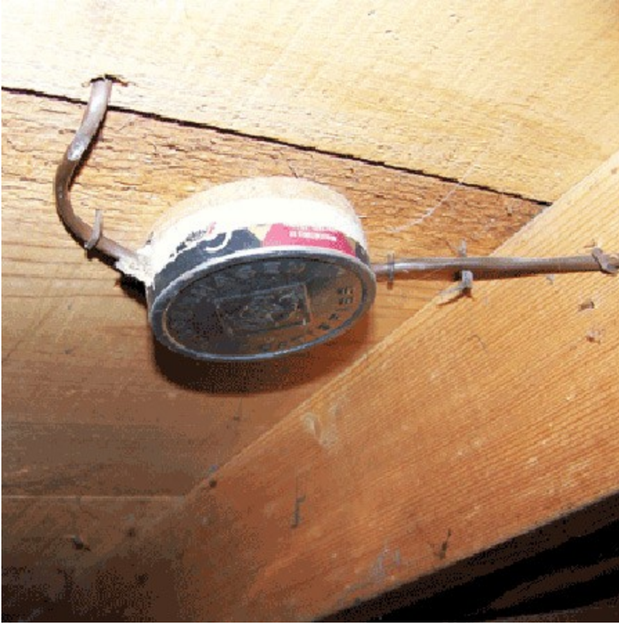
Dip can j- box, from good ole boy engineering and power wiring installers Inc.