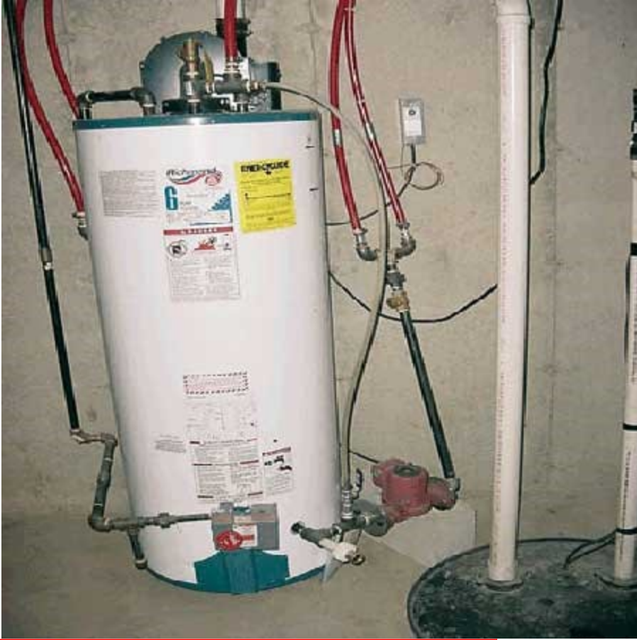
The Frankenstein design for gas water heaters