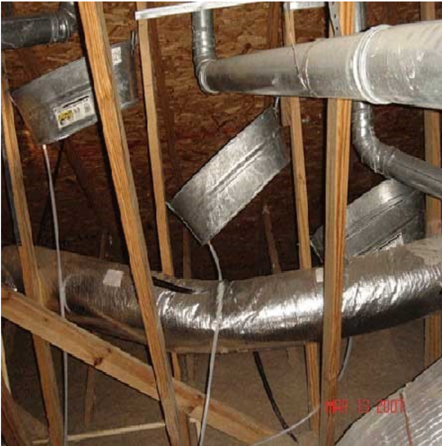
Back-up system for the no flashing design for roof penetrations