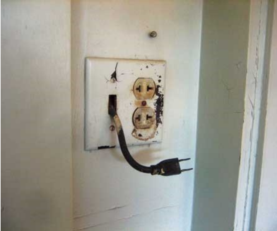
New ceiling fan connection