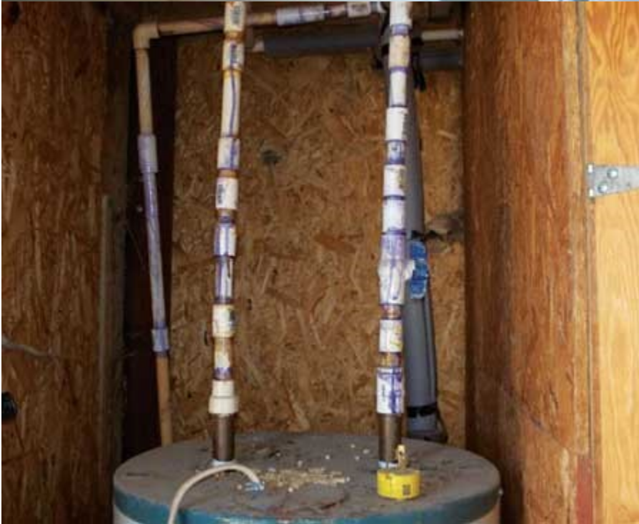
What you can do with a little PVC pipe and a lot of couplings