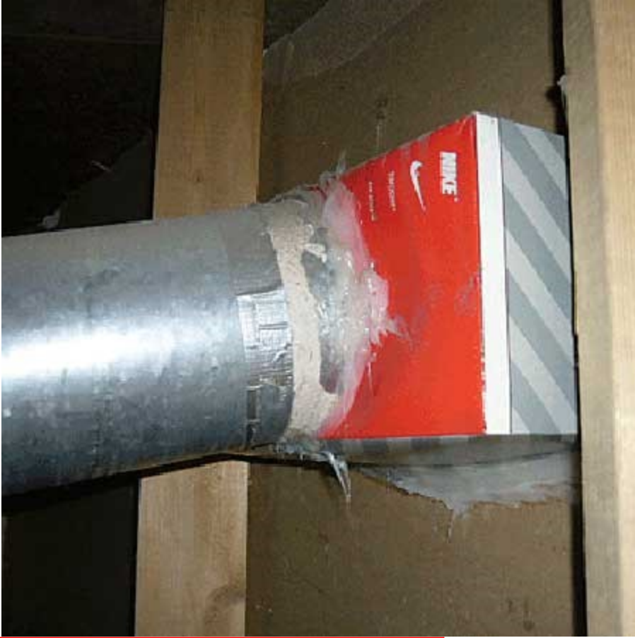
The latest in designer outside air plenums