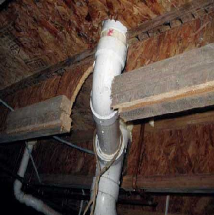
Didn't need that beam anyway!